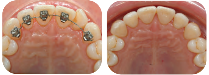
Treatment time: 7 weeks