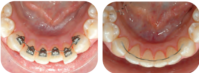
Treatment time: 6 weeks