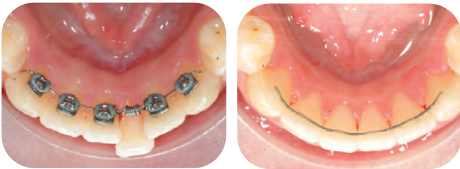
Treatment time: 6 weeks