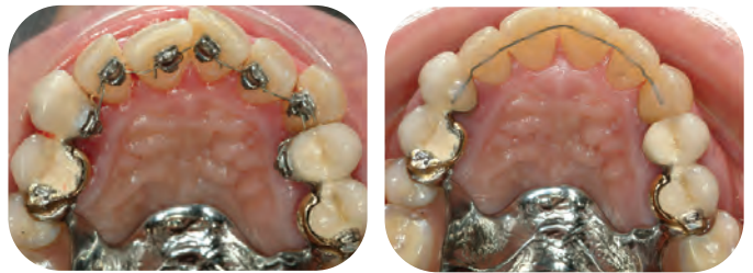
Treatment time: 11 weeks