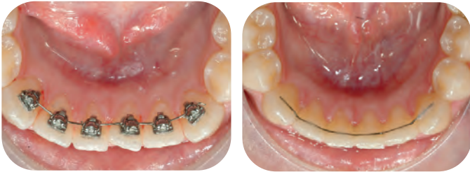
Treatment time: 5 weeks