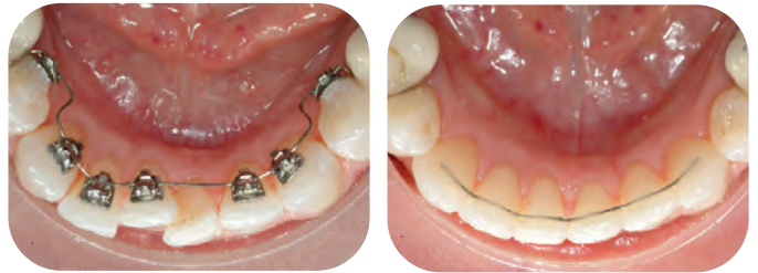
Treatment time: 8 weeks