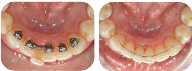
Treatment time: 6 weeks